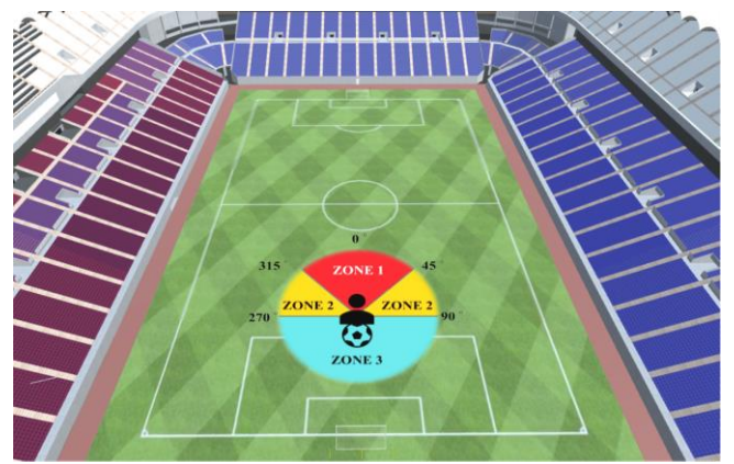
Figure 1. AVEA zonal division.

Zone 3 : The area requires 180-Degree Exploratory Activity. The area is between >90^{\circ} and <270^{\circ} clockwise, including the area behind the player, requiring a full rotation on the pivotal point in order to explore visually. The AVEA score is calculated by measuring the total percentage of frames in which the player enters zone 2 and 3. A figure depicting the zonal division may be seen in figure 1.